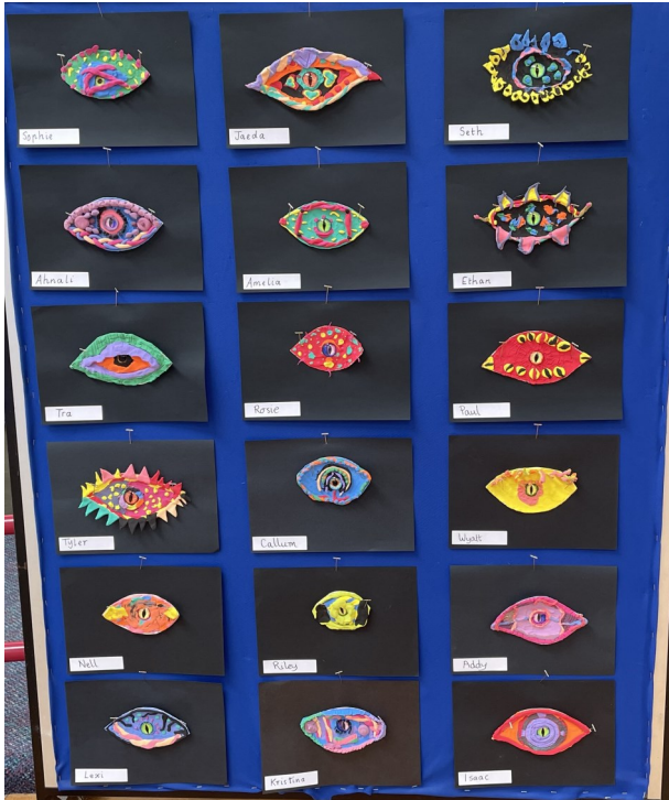
Visual Arts - Bright Eyes made with Air Dry Clay! These are so intriguing!