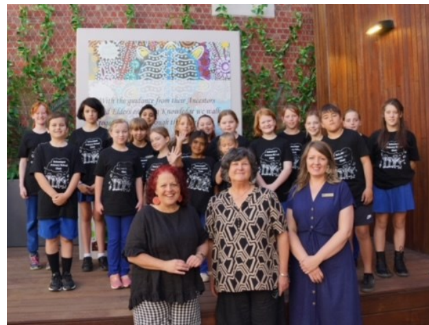
The Sebastopol PS choir performing at the Victorian Academy of Teaching and Leadership in Camp Street, Ballarat on Tuesday.