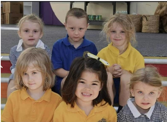
Prep Class 2024 as featured in The Courier 6th March

Book tickets at mountclearcollege.vic.edu.au